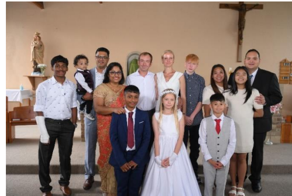
Last year's First Communicants celebrate at Our Lady of Lincoln and St Guthlac church Deeping St James